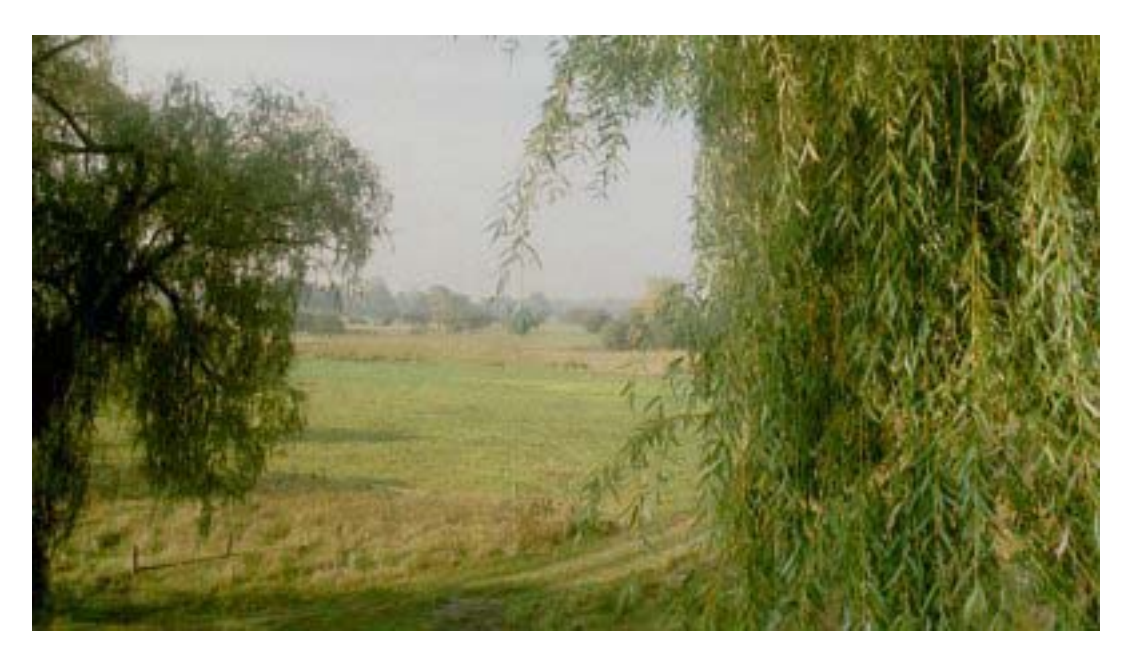
Pastures near Secymin

The countryside is very flat and wide, with ditches dividing the land into sections. The only interruptions are old willow trees, obviously pruned fairly recently, tall poplars, some oak trees and small islands of bushes.