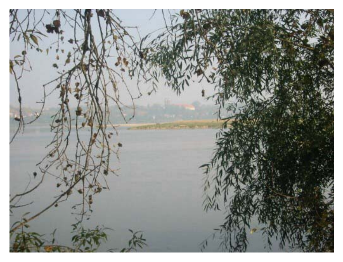
The Vistula near Sladów

We walked along the levee for a bit, enjoying the breadth of the countryside in the unbelievably warm autumn weather. On the bank we took some photos of this wonderfully beautiful river. Pictures such as these should be framed! An old apple tree had lavishly given away its fruit, many apples lay there in the grass, red and appetizing. We picked up some of them. They tasted very sweet, having very little acid. What a pity, we didn't think of taking some back to Aunt Amanda; perhaps she would have recognized the type.