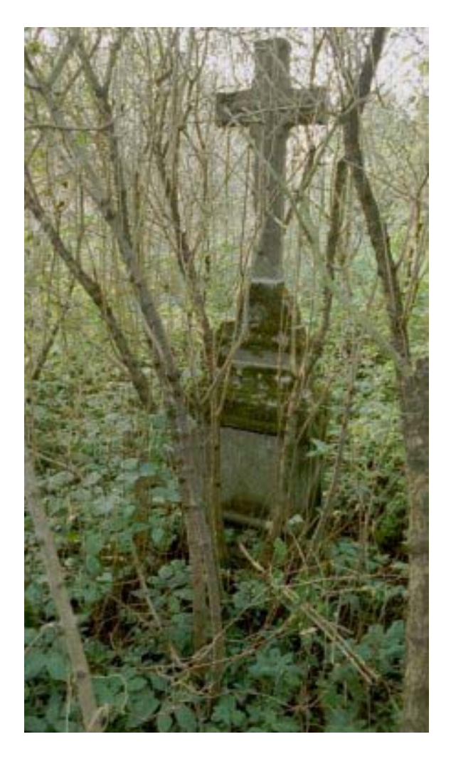
Grave at the cemetery in Wionczemin