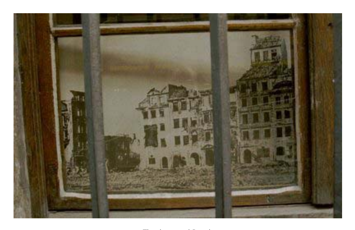
The destroyed Rynek

The picturesque old town stands high above the banks of the Vistula. We had no difficulty finding it, and parked our car in one of the parking lots with a 24-hour watch. We let the flow of people carry us around, and the wonderful buildings astounded us over and over. The palace, the university, the splendid and richly decorated period homes on the Stary Rynek, the old town market. But all this glory is but an illusion. None of these houses is as old as it appears. The Polish capital was flattened to the ground at Hitler's order. Hardly one stone was left standing on the other. Old photographs, mounted unobtrusively in some of the windows reminded passersby of what had happened.