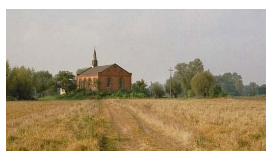
The church at Wionczemin

Our final attempt to reach the church by car ended in frustration, and we finally parked it on the side of the road, choosing to approach the church on foot.