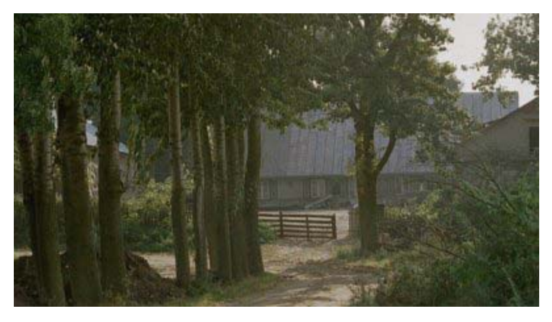
Farm at Troszyn

brought to the sweet meadows of the islands explained Aunt Amanda. Not with a raft! No, she said, the animals can swim. The farmer simply tied the lead cow's tether to a rowboat and the rest of the herd simply followed obediently, swimming next to the boat in a well-behaved manner.